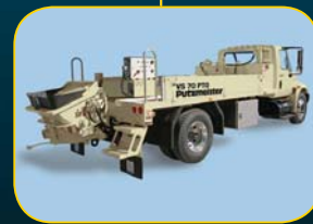
VS Series • Vehicle Mounted Refer to separate specification sheet.