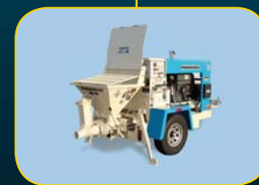
TKB Series Hydraulic Ball Valve Pumps Refer to separate specification sheet.